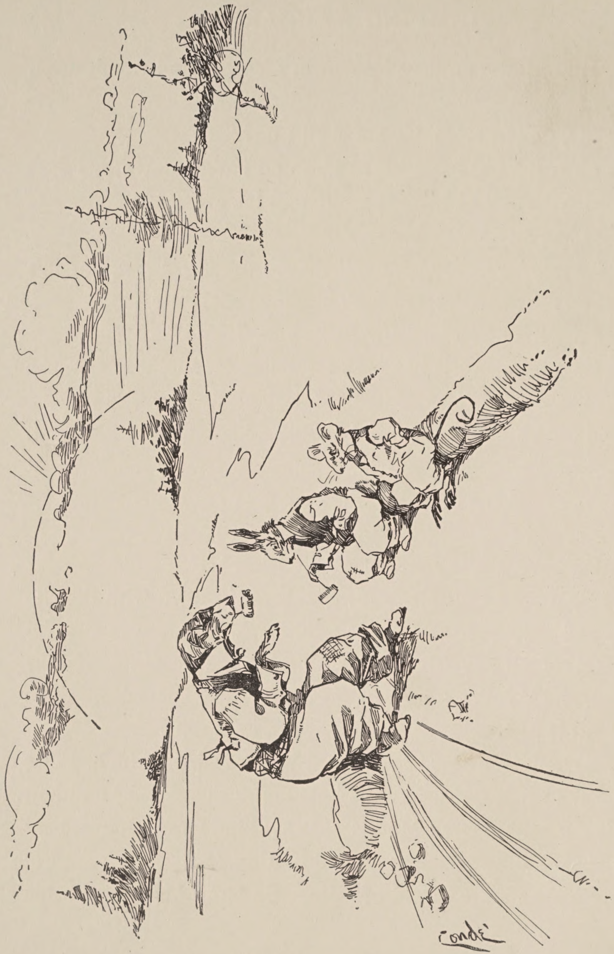
ALL THREE ARE VERY GOOD FRIENDS.